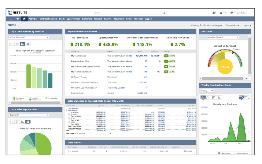
Get real-time visibility into sales, pipeline and forecasts.

NetSuite CRM+ provides SFA that equips the sales team with an accurate record of each opportunity and its status, a complete view of the prospect and real-time access to every detail.